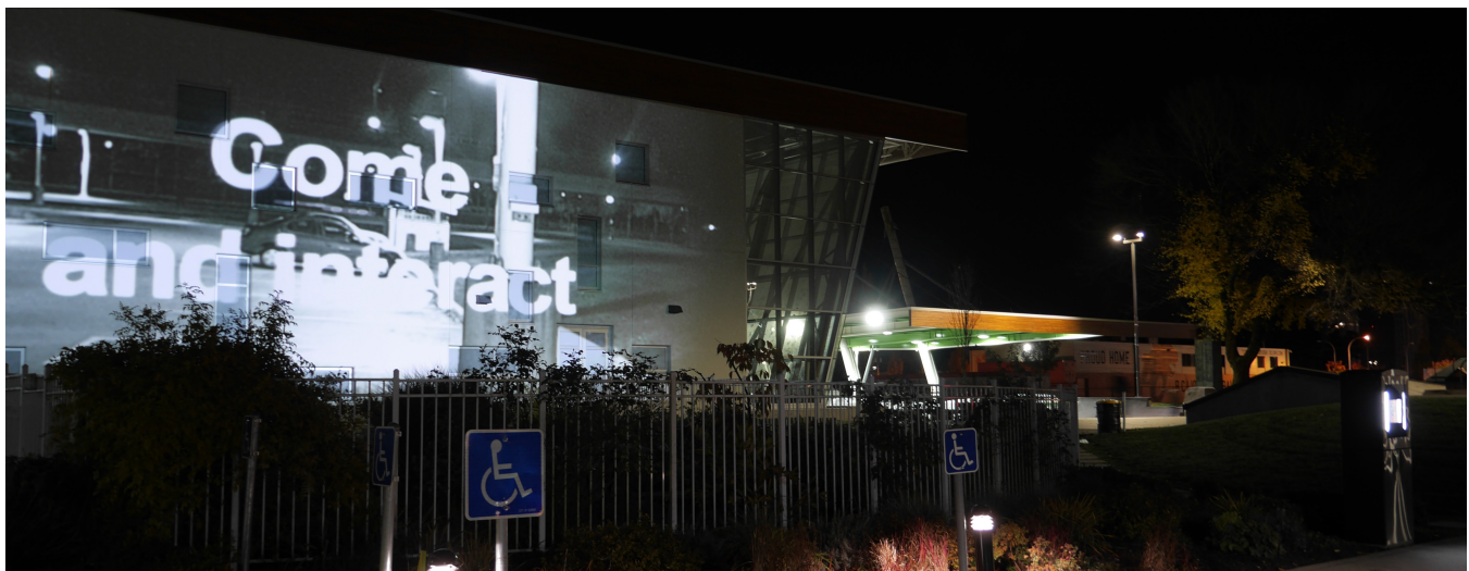
When not in use, the projection encourages participation through messages in both English and French.

Surrey Art Gallery gratefully acknowledges Creative BC, the Province of BC through the BC Arts Council, and French Consulate Vancouver/Consulat général de France à Vancouver for their support of this project.